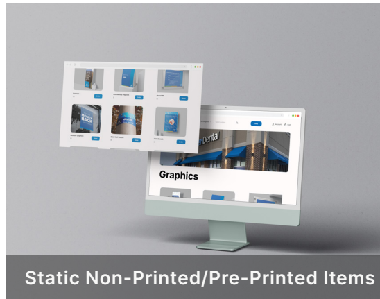
Static Non-Printed/Pre-Printed Items