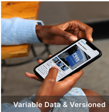
Variable Data & Versioned