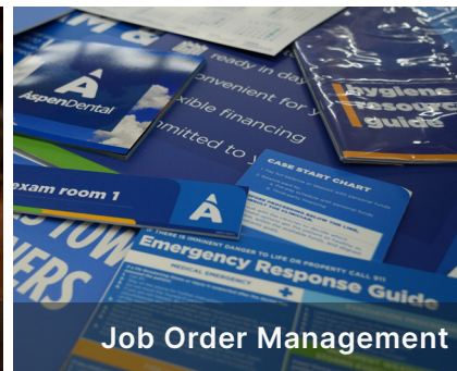
Job Order Management