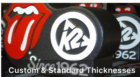
Custom & Standard Thicknesses