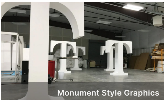
Monument Style Graphics