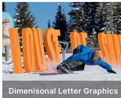
Dimensional Letter Graphics