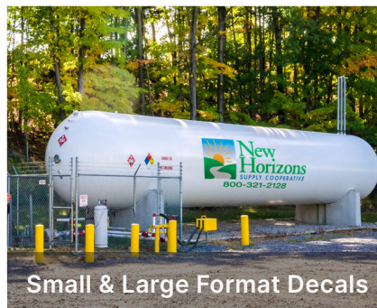
Small & Large Format Decals