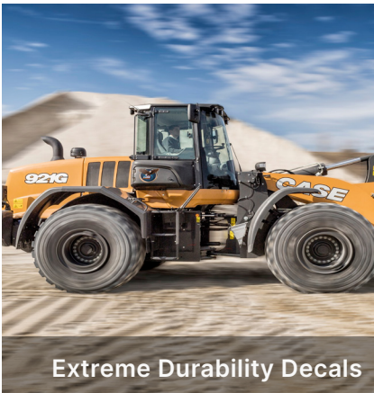
Extreme Durability Decals