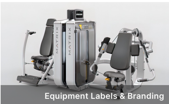
Equipment Labels & Branding