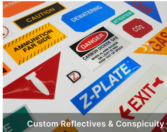
Custom Reflectives & Conspicuity