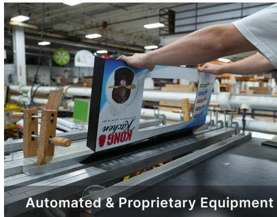
Automated & Proprietary Equipment