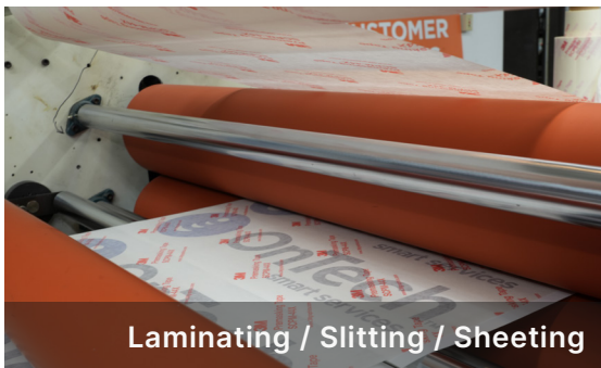
Laminating / Slitting / Sheeting