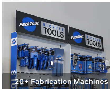
20+ Fabrication Machines