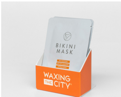
Any 3D Shape Imaginable