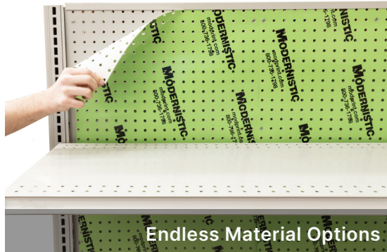
Endless Material Options