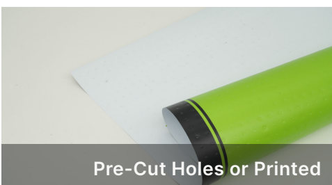
Pre-Cut Holes or Printed