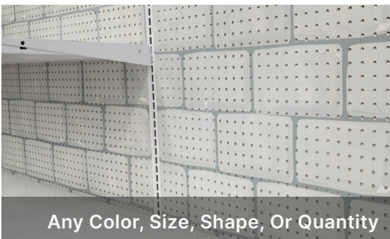
Any Color, Size, Shape, Or Quantity