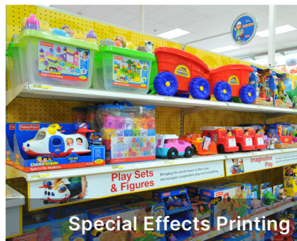
Special Effects Printing