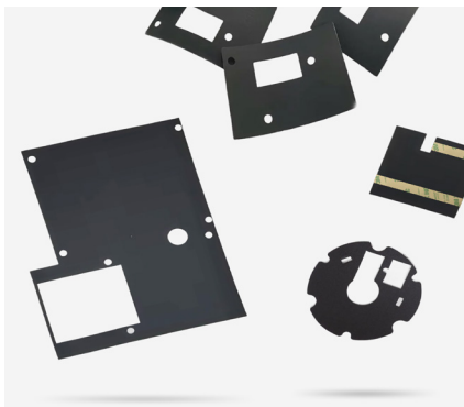
Insulators & Spacers