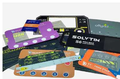
Labels, Decals, & Overlays